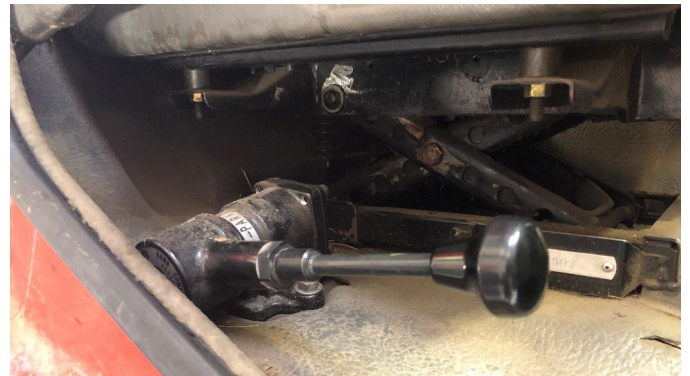
Sanwa Seiki park brake on right-hand side of driver's seat

If a vehicle owner has any queries, please ask them to email vehicles@nzta.govt.nz with the subject line 'Nissan brakes' or call our contact centre on 0800 699 000.