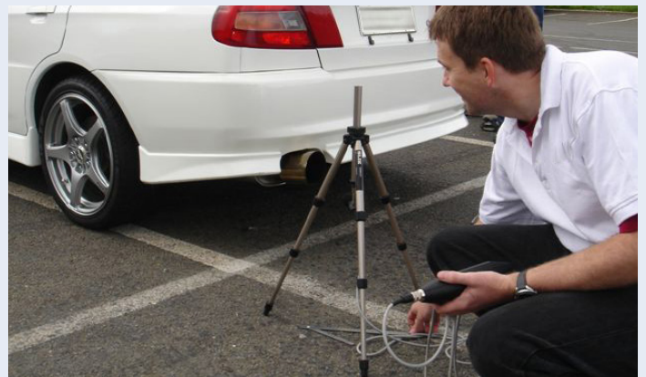
Objective noise tests being carried out