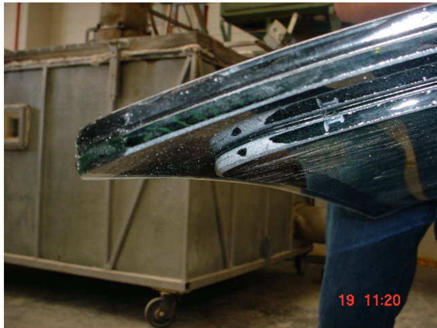
B) View of edge of 21 mm windscreen (3 layers). Two layers fit the OE windscreen mount, the other layer fits within the inside windscreen aperture.